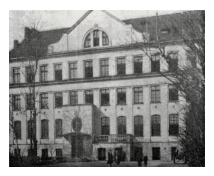
Orphanage Dom Sierot 1928.