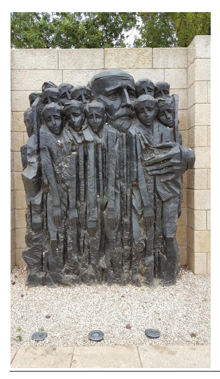
The Children's Monument in Yad Vashem.

On 6 August 1942, the children and management of the orphanage were taken away to the 'Umschlagplatz'. Korczak asked them to take something along that they cared for, a book or a toy. In a dignified procession, with the flag of King Matt and the Star of David, proceeded to the assigned location. The oldest children carried the smallest ones to the freight wagons. Korczak had another chance at escape but did not leave his children alone. Two days later, all died in the Treblinka gas chambers.